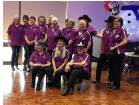
The Esperance Bay Bootscooters entertaining the crowd at Winter Wonderland.