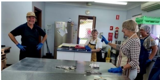
Behind the scenes, the kitchen volunteers are hard at work preparing lunch for us.