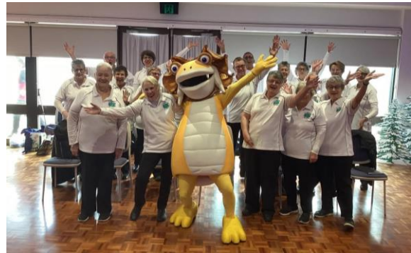
The Esperance Community Singers entertaining the crowd at Winter Wonderland